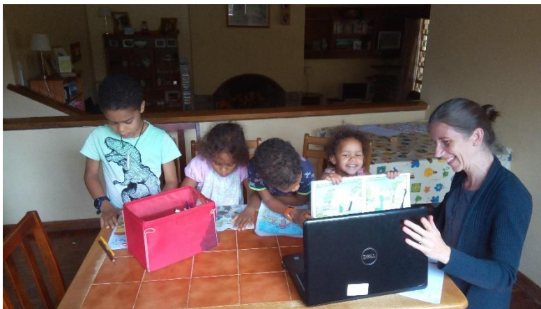
One of the zoom meetings with church families