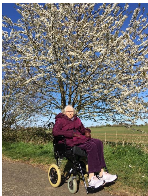
Rachel's mum enjoying an afternoon walk